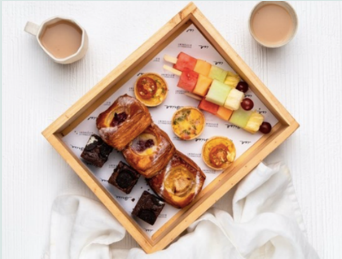
AM/PM Package 1