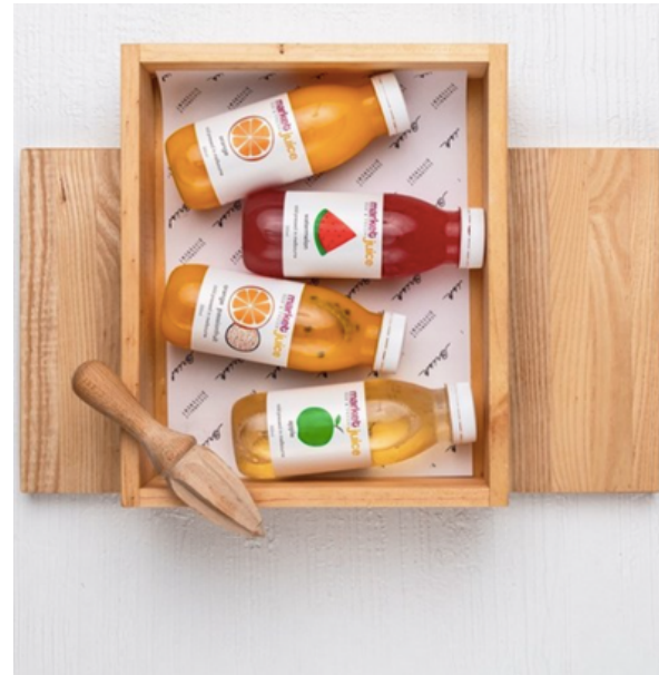
Cold pressed juices