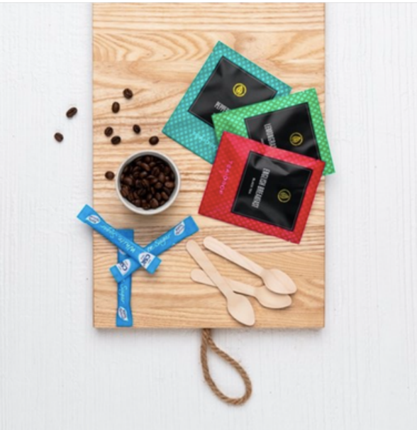
Tea & Coffee