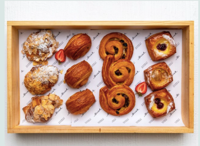
AM/PM Package 3