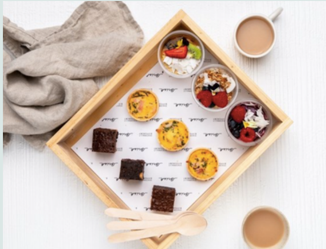
AM/PM Package 2